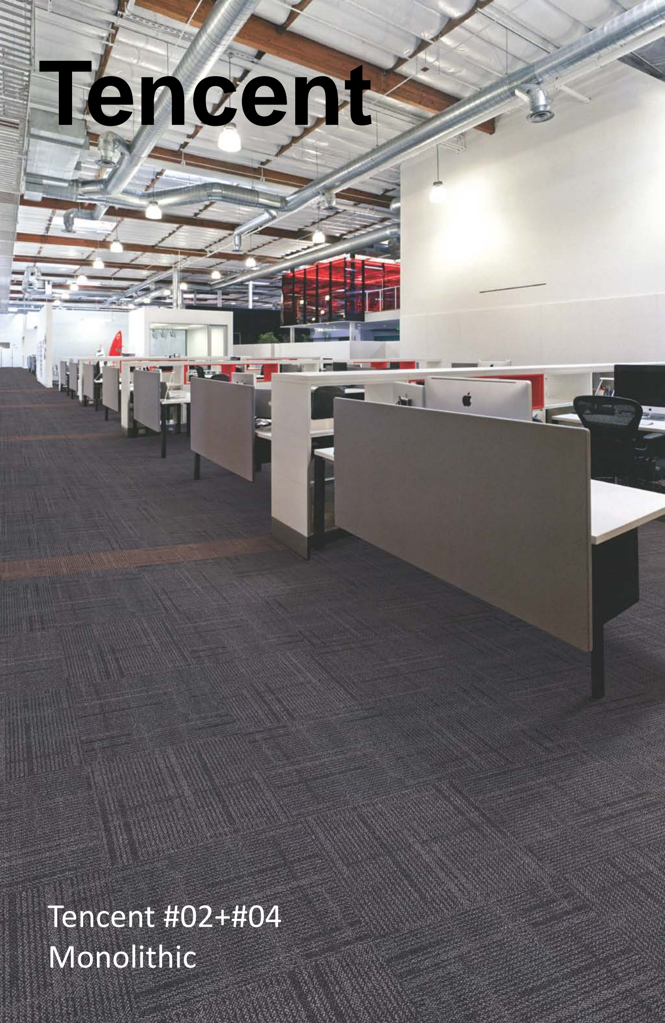
Tencent #02+#04 Monolithic